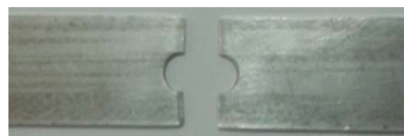
Fig.1 The fracture of the component with a hole in the tensile test

This model requires knowledge of the parameters to be applied. To determine these parameters for Al 5083, several tests should be done. Also, for verification of this model, the authors have used 3 types of tests (simple tensile, cyclic and test with hole). Fig.1 shows a component with a hole after the tensile test.